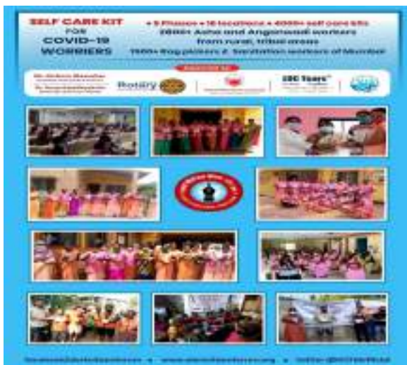
Self Care Kit Distribution - Alert Citizens Forum