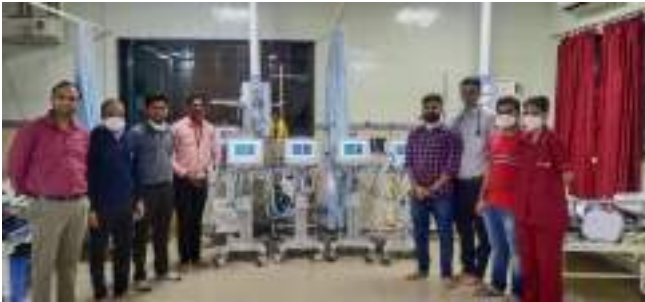
Ventilators funded and installed at Chiplun - Helping Hands Foundation

Foundation facilitated the funding and installation of 4 Schiller Ventilators at Walawalkar Hospital in Chiplun, Rural Maharashtra. On 29 July, Helping Hands Foundation sent 400 kits to Asha Workers in Latur and Udgir districts