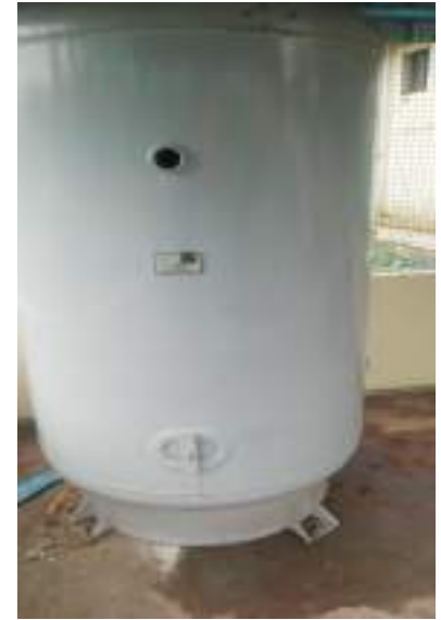
LPM PSA Oxygen concentrators plants reach Nanded - UNICEF

On 30th July, 400 LPM PSA Oxygen Generation plants supplied by UNICEF ( 1/5 plants supported in Maharashtra) reached DH Nanded for installation. On 1 August, 55 Commercial Sex workers vaccinated in Nashik with