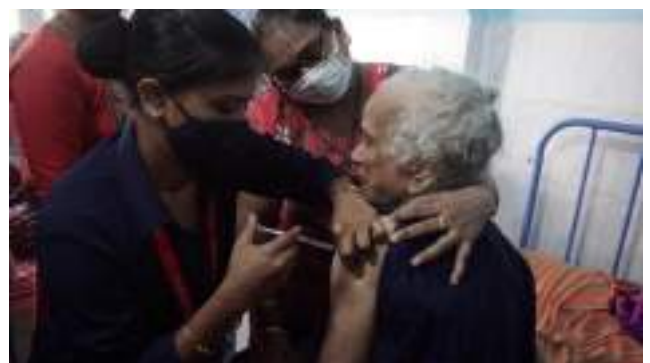
Vaccination drive for bed-ridden - Project Mumbai